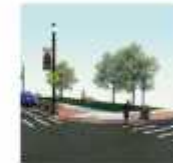
Improved Pedestrian Crossings